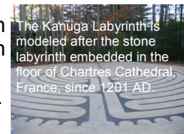
The Kanuga Labyrinth is modeled after the stone labyrinth embedded in the floor of Chartres Cathedral, France, since 1201 AD.